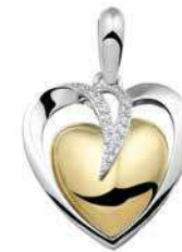
'See You' memorial jewellery

We offer a significant range of keepsakes and memorial jewellery that incorporate or store ashes. See our separate brochure for more details.