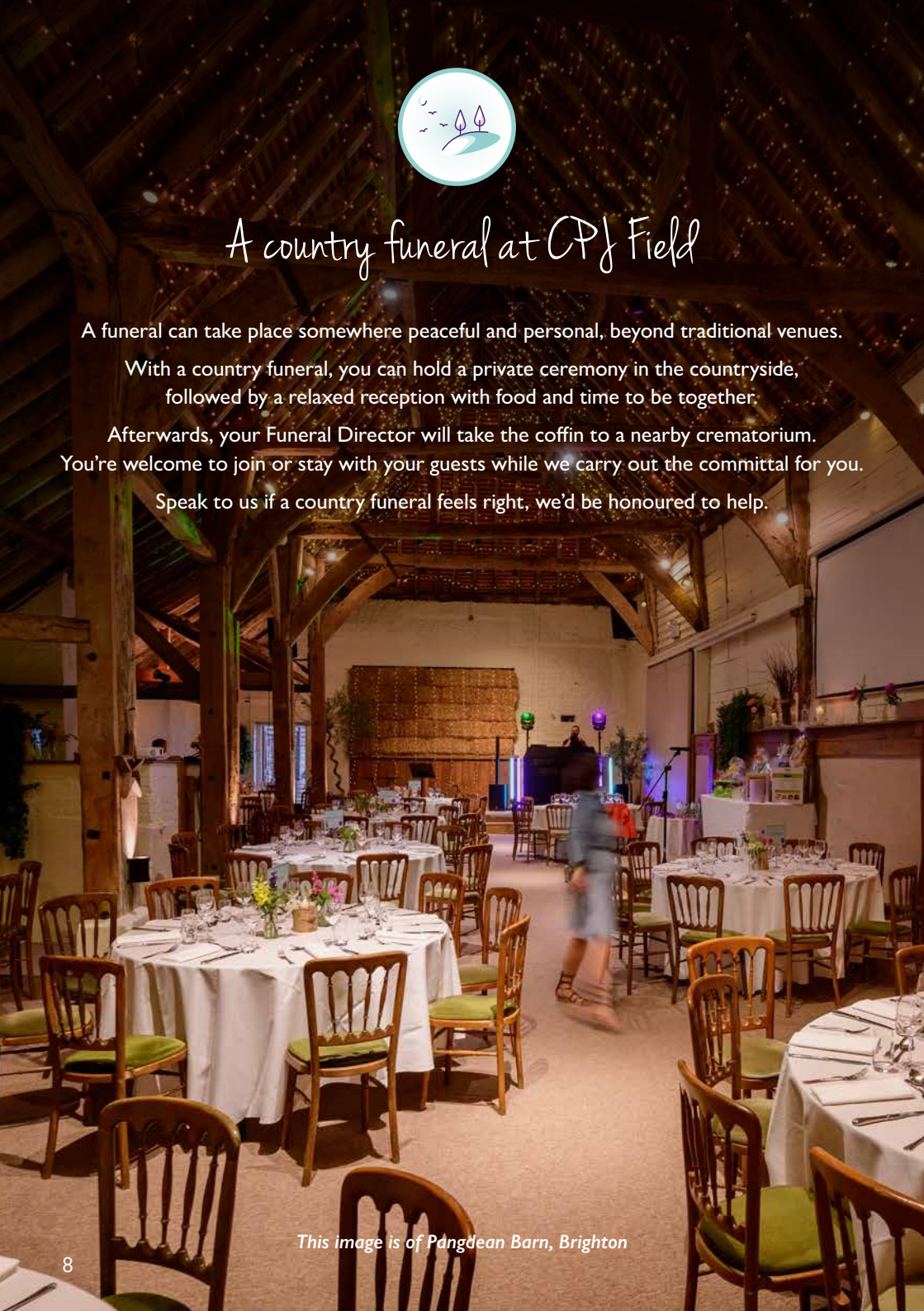
This image is of Pangdean Barn, Brighton

For more on how to make a funeral greener by understanding its environmental impact, visit greenergoodbyes.co.uk