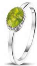
'Ashes into glass' memorial jewellery