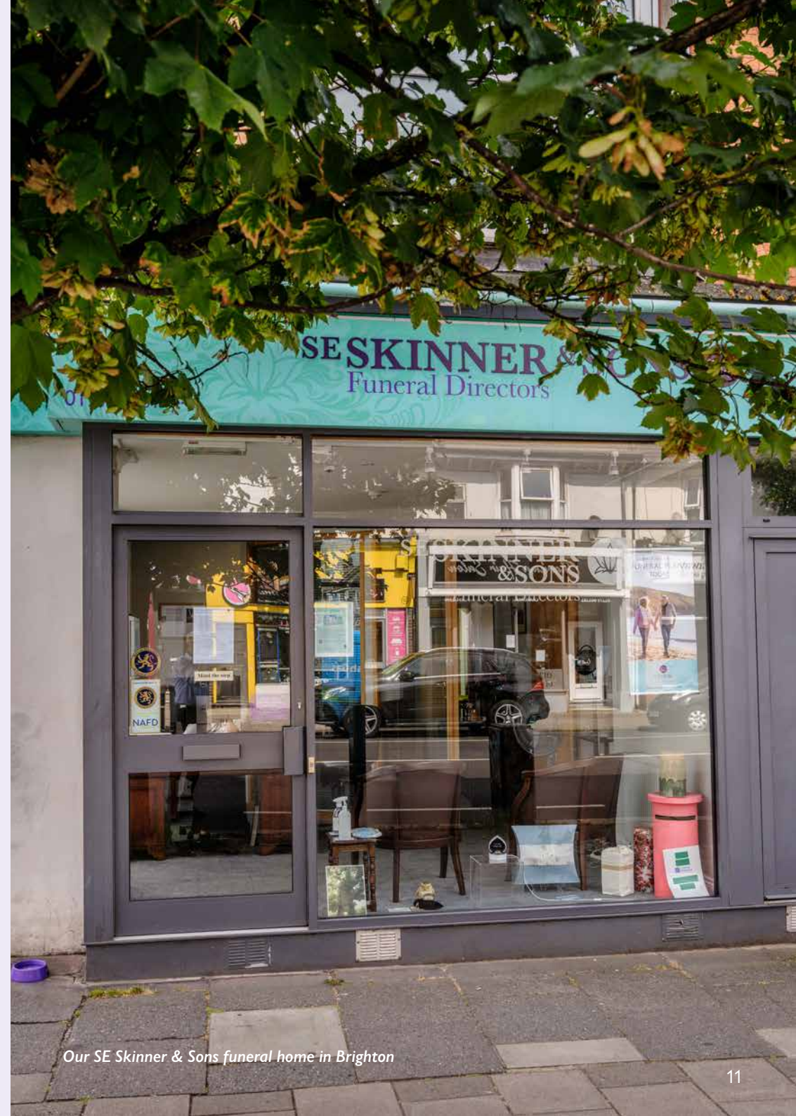
Our SE Skinner & Sons funeral home in Brighton