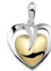
'See You' memorial jewellery

We offer a significant range of keepsakes and memorial jewellery that incorporate or store ashes. See our separate brochure for more details.