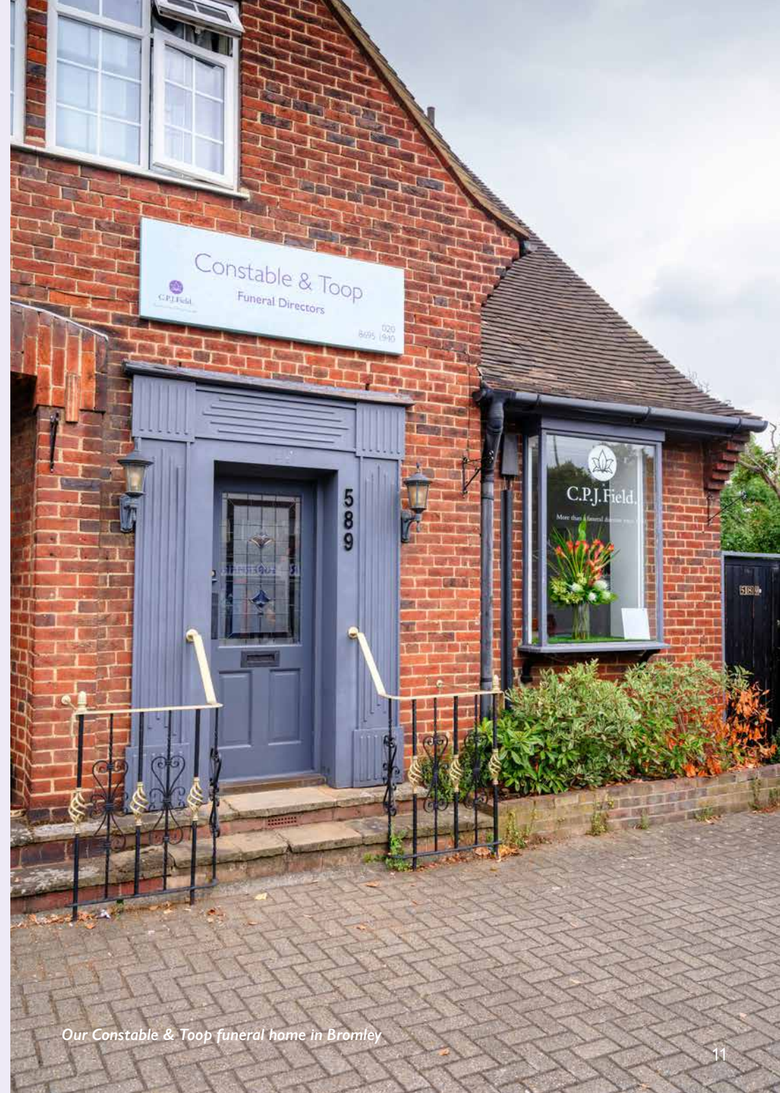
Our Constable & Toop funeral home in Bromley