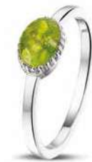
'Ashes into glass' memorial jewellery