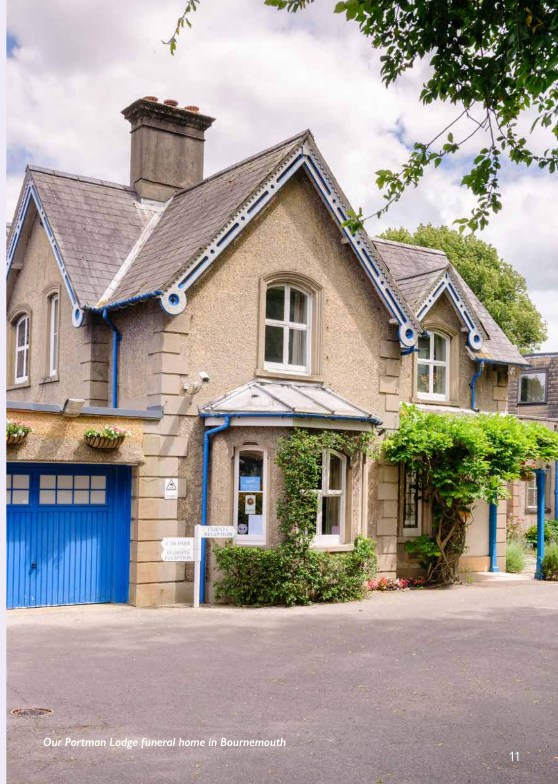
Our Portman Lodge funeral home in Bournemouth