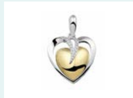
'See You' memorial jewellery

We offer a significant range of keepsakes and memorial jewellery that incorporate or store ashes. See our separate brochure for more details.