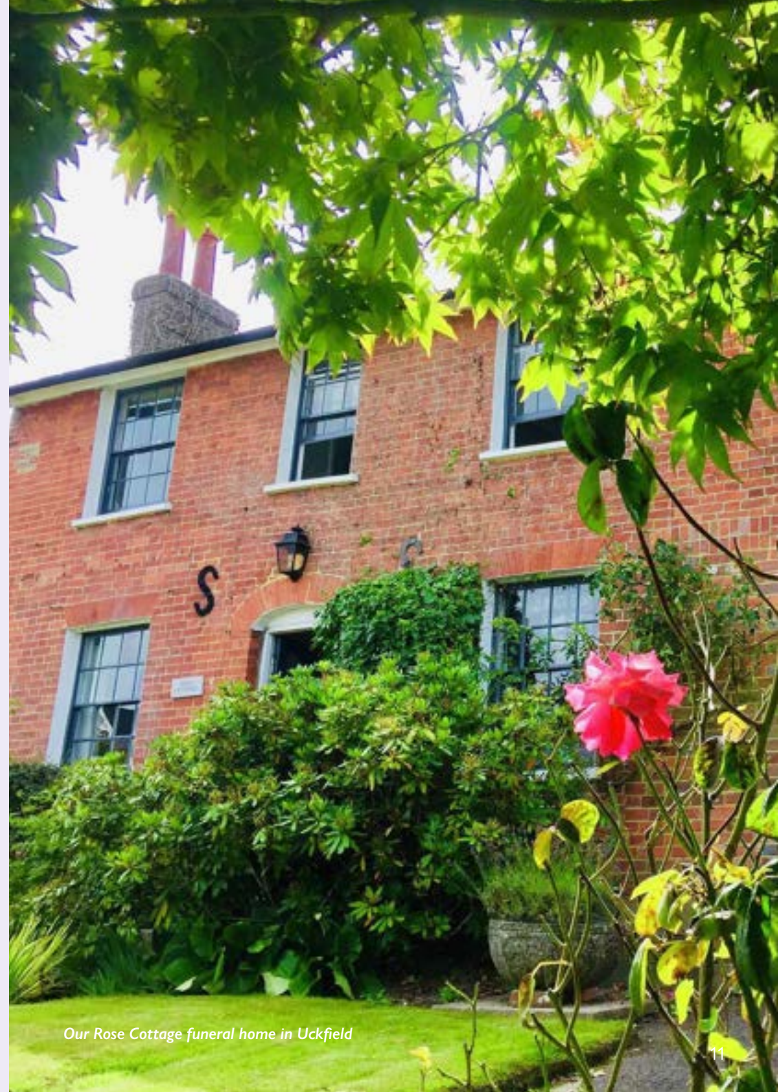
Our Rose Cottage funeral home in Uckfield