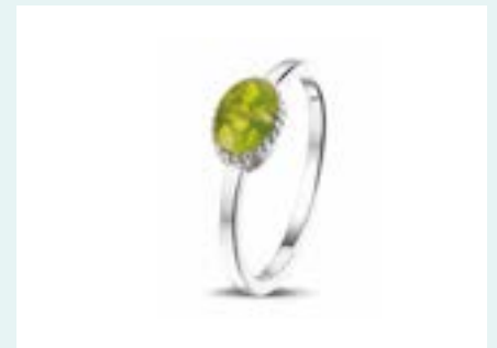
'Ashes into glass' memorial jewellery