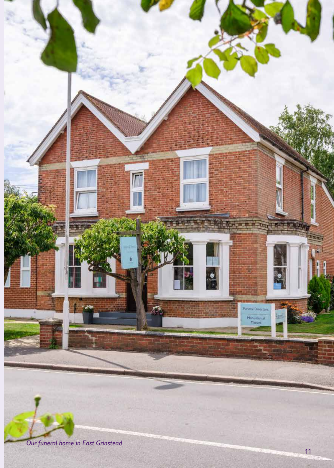
Our funeral home in East Grinstead