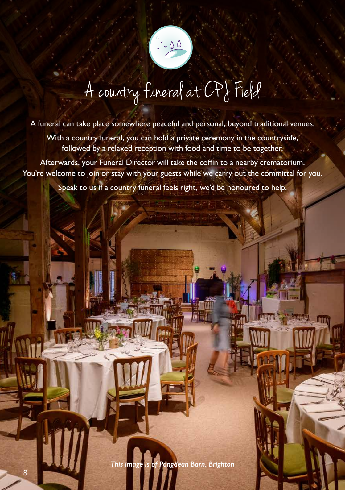
This image is of Pangdean Barn, Brighton

For more on how to make a funeral greener by understanding its environmental impact, visit greenergoodbyes.co.uk