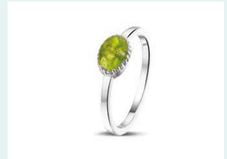
'Ashes into glass' memorial jewellery