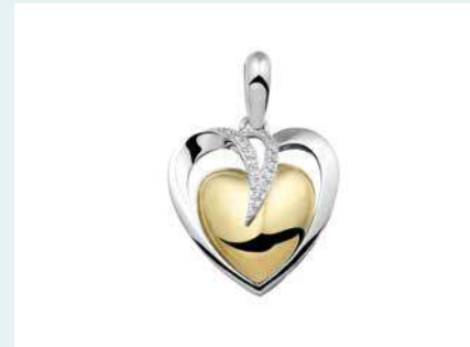
'See You' memorial jewellery

We offer a significant range of keepsakes and memorial jewellery that incorporate or store ashes. See our separate brochure for more details.