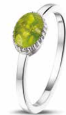
'Ashes into glass' memorial jewellery