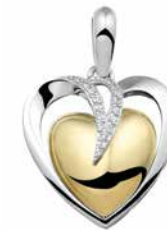
'See You' memorial jewellery

We offer a significant range of keepsakes and memorial jewellery that incorporate or store ashes. See our separate brochure for more details.