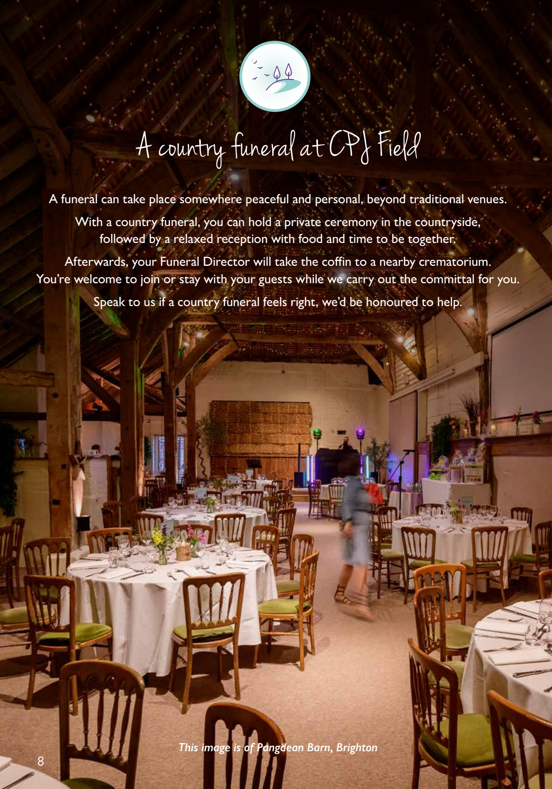
This image is of Pangdean Barn, Brighton

For more on how to make a funeral greener by understanding its environmental impact, visit greenergoodbyes.co.uk