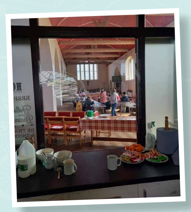
The Front Room Club in Bromley

At Constable & Toop in Bromley, the team volunteered at the front room club at St Luke's Church.