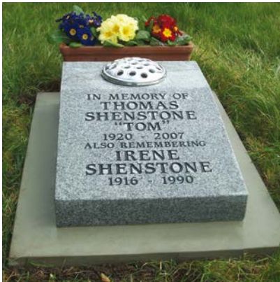
LA7: Light grey granite