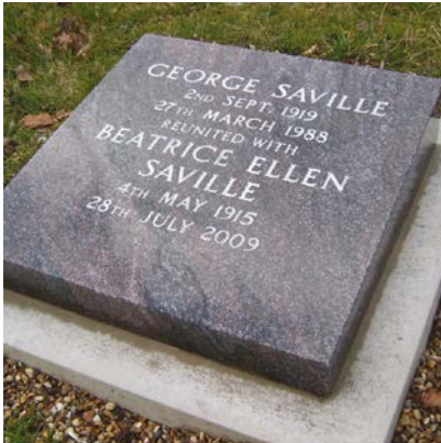
LA5: Paradiso granite