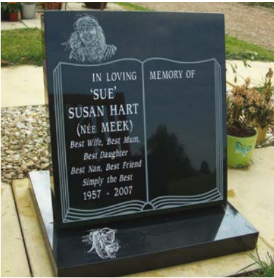
LA10: Black granite