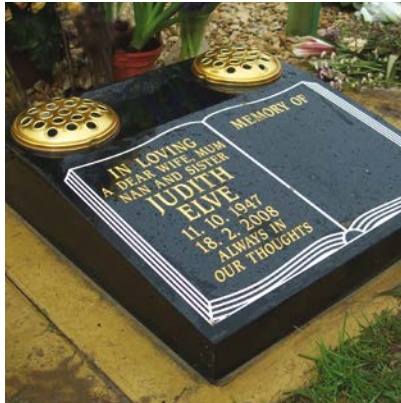
LA6: Black granite