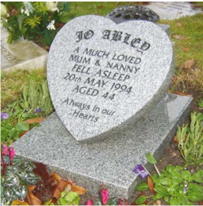
LA9: Light grey granite