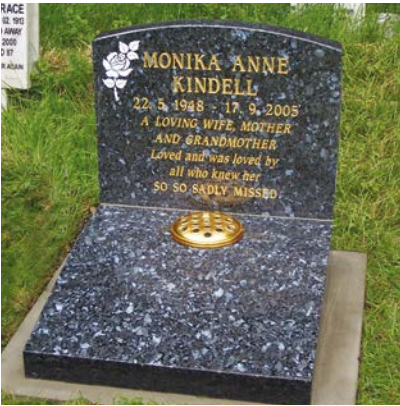
LA11: Blue pearl granite