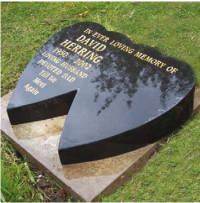
LA12: Black granite