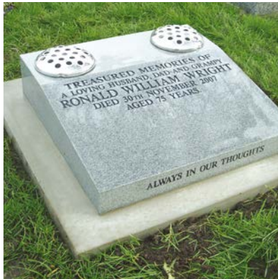
LA8: Light grey granite