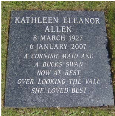
LA3: Dark grey granite