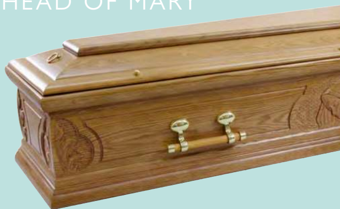
HEAD OF MARY